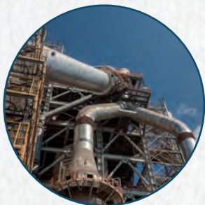
Cement kiln heat exchanger